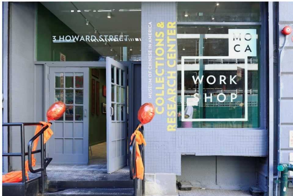
Figure 4. Zhao, J. (2020, October). MOCA Workshop: Collections and Research Center.

As the arrival of MOCA's 40th anniversary, MOCA opened the MOCA Workshop for public viewing on October 17th and announced their future recovery plans. One goal is to cooperate with schools to let students learn about collection management and conservation knowledge by restoring MOCA's collections. "Everything is coming back. It has been stabilized. This is the beginning of a new tomorrow," said Nancy Yao Maasbach during the anniversary (Hsu, 2020).