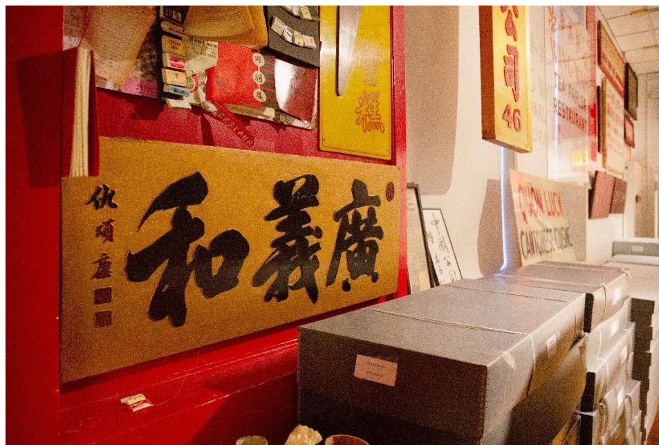
Figure 1. Zhao, J. (2020, January). MOCA's Collections and Research Center at 70 Mulberry Street, New York. Retrieved from https://media.newyorker.com/photos/5e2f1214261ed00008d2f094/master/w_2560%2Cc_limit/Hsu-MOCAFire-1.jpg

On January 23, 2020, the 70 Mulberry experienced a five-alarm fire. Around 8 pm, the fire started on the fourth floor and quickly burned to the fifth floor, destroying its roof. The collapse extended to the third floor, and the shake caused MOCA's collections on the high shelves to fall. Firefighters soon arrived and pumped water into the building for more than 20 hours. Water penetrated the floors, accumulated, and soaked many collections on the lower shelves and artifacts that fell on the floor. After two days of rescue, the fire was finally gone. By carefully observing the building that just suffered from a fire, people could see the collection boxes through an opened window of the second floor. Came across the disaster and exposed to the weather through the opened window, the storage space loses the constant temperature and humidity. Much worse, the museum staff members were told that no one would be allowed to enter and retrieve the items for months.