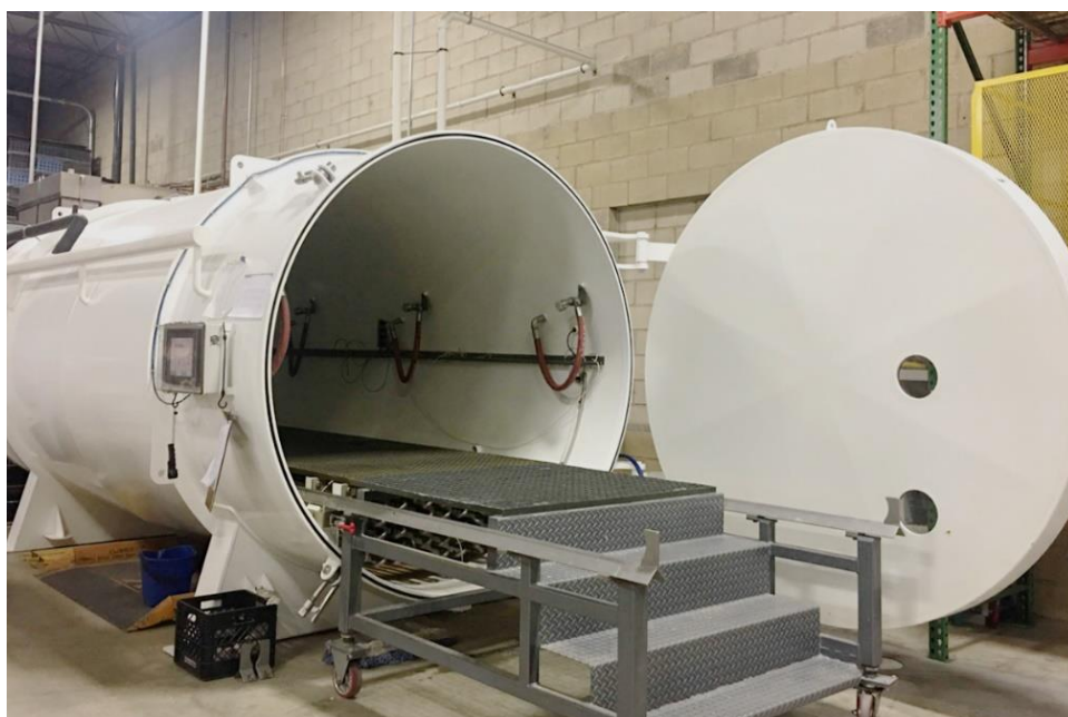
Figure 3. Ma, Y. (2020). Polygon's chamber for freeze-drying artifacts, 2020. Retrieved from https://user-images.githubusercontent.com/47676628/89826840-d3fb7880-db24-11ea-94d1-e4d8d62f5bbf.jpg

collections, including paper works and vinyl, films, DVDs, and magnetic tapes. Some of the objects 4 mentioned can not be freeze-dried, and the company staff was not familiar with this conservation knowledge. Everything was put into the freezing room during the weekend, and on the next Monday, media materials such as glass negatives, films, types, and DVDs were taken out under Yue Ma's in-person guidance.